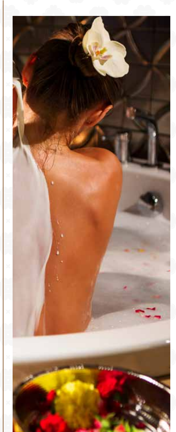
RAISING PAPILLON'S STANDARDS