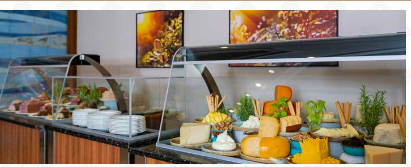
RAISING PAPILLON'S STANDARDS