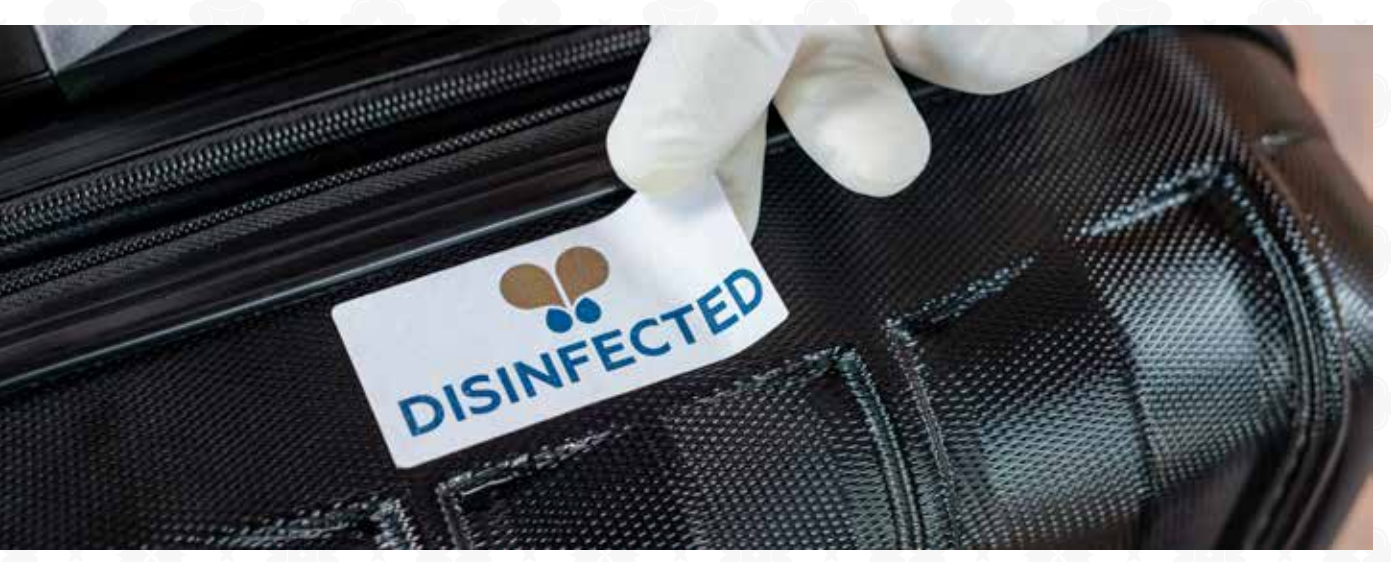
RAISING PAPILLON'S STANDARDS