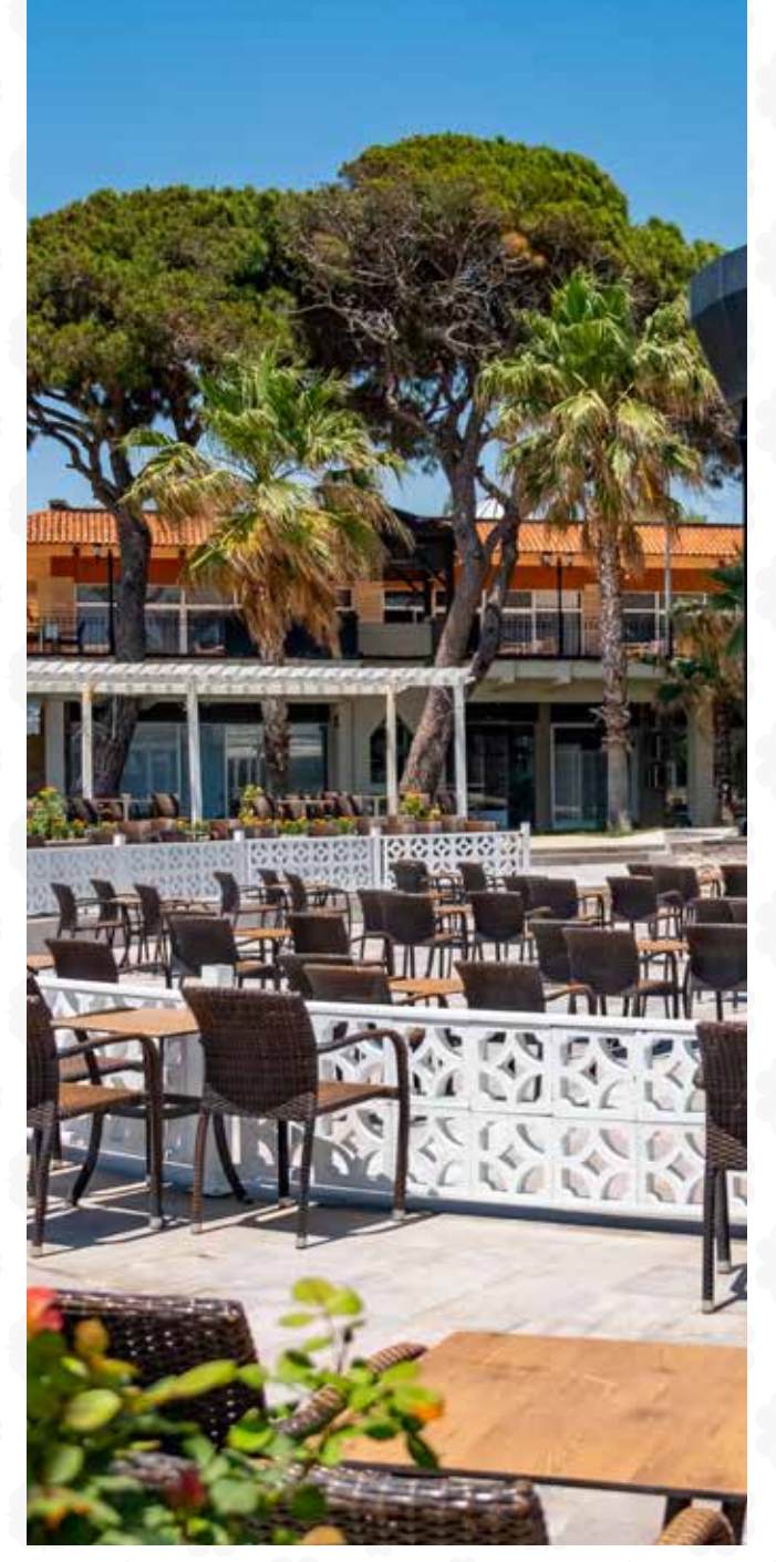
STANDARDS RAISING PAPILLON'S